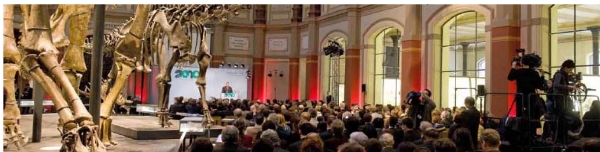
14 OTHER RELEVANT INFORMATION

tious National Strategy on Biological Diversity in 2007, covering all aspects relevant to the issue. The strategy's aim is to mobilize and bring together all the relevant social forces in order to permanently reduce the threat to biological diversity, improve its sustainable use and halt its loss.