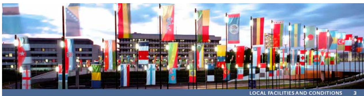
LOCAL FACILITIES AND CONDITIONS 3

privileged access to the World Conference Center Bonn and be able to use it at preferential rates. By the same token, UN events will make a contribution to Bonn's aim of setting new standards for conference locations. The many and varied opportunities for dialogue will create an ideal environment for institutions and companies based here.