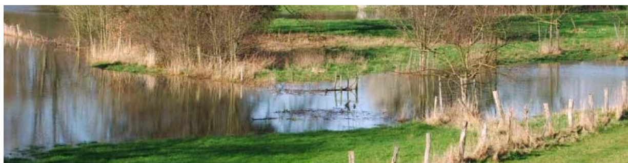
OTHER RELEVANT INFORMATION