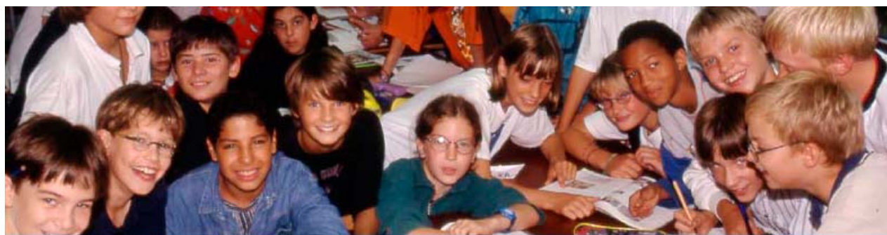
8 LOCAL FACILITIES AND CONDITIONS