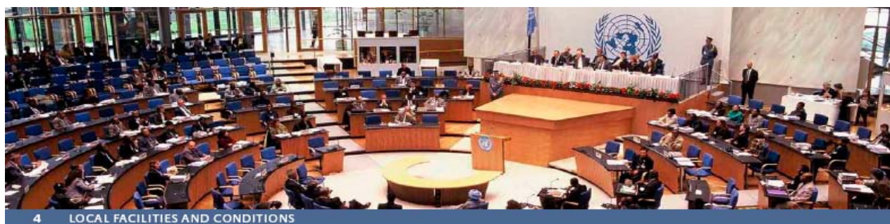
4 LOCAL FACILITIES AND CONDITIONS

offers a flourishing cultural and academic environment. The Ruhr/Rhine/Main region stretches from Düsseldorf via Cologne and Bonn through to Frankfurt am Main, forming a central 250-km axis. Its infrastructure – a dense network of motorways, regional and international air and rail connections – meets the requirements of organisations with global operations and travel needs.