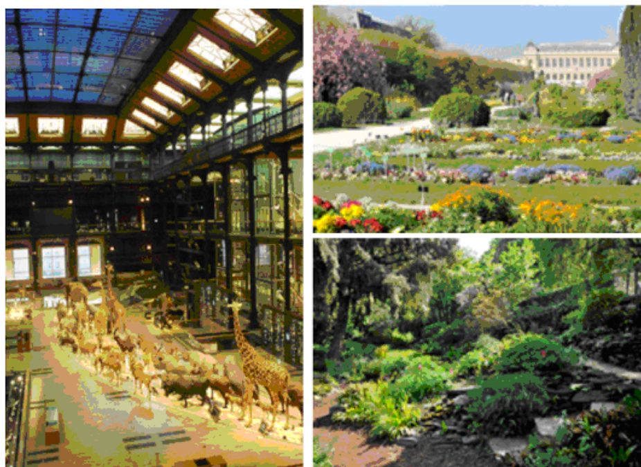
(MNHN : Grande Galerie de l'évolution, Jardin des Plantes, Jardin Alpin)