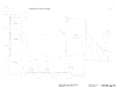
(Musée de l'Homme renovation plans)

This area will be renovated to meet the needs of the IPBES, on the basis of the United Nations standards. They will have capacity for up to 40 people. The general maintenance, the building up-keep and the outside security will be the responsibility of the MNHN's services.