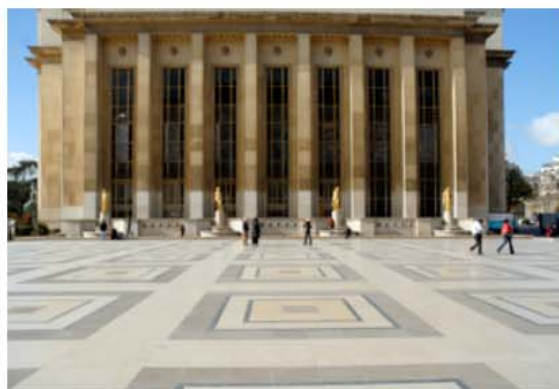
(Palais de Chaillot, Place du Trocadéro)