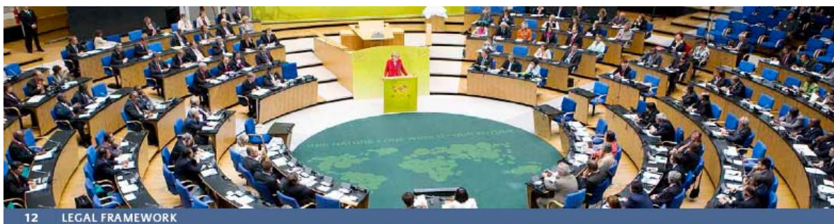
12 LEGAL FRAMEWORK