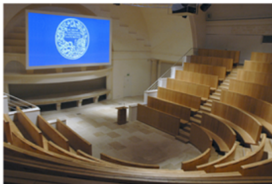
(MNHN Grand Amphitheater)

These rooms, furnished with modern equipment, will be made available against compensation for the technical costs incurred, under the same conditions as for members of the Muséum national d'Histoire naturelle, an institution under the guardianship of the Ministry of Higher Education and Research.