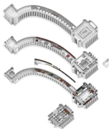
(Musée de l'Homme renovation project)

These IPBES offices are located within the Musée de l'Homme, an anthropological gallery of the MNHN. They are on the second floor in the Passy aisle section of the Palais de Chaillot, in the Pavillon d'about. They benefit from natural light. A private entrance from the "Swiss Garden" provides access to these offices with a total surface area of 500 m 2 equally distributed on two connected floors.